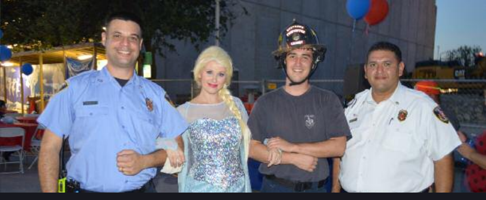
Southside Fire Department and Elsa the Snow Queen