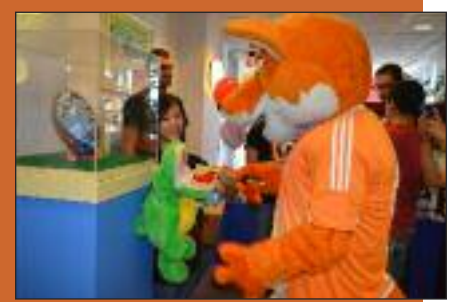
Houston Dynamo's Diesel gave a