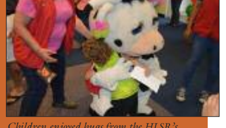
Children enjoyed hugs from the HLSR's Miss Moo.