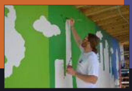
Thank you Chevron