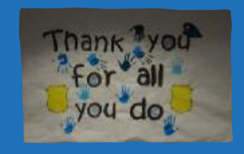
The CAC appreciates all the work our officers do.

September 14th-September 18th, 2015, The Children's Assessment Center Foundation Board provided breakfast for CAC Law Enforcement office in recognition of Law Enforcement Appreciation Week. It was a fun week and gave CAC staff and partner agencies a chance to stop by and say thank you to the officers working hard each day to protect the children of Harris County. Thank you to everyone that participated. The CAC also like to sends special thank you to community members who donated and contributed giveaways to make the officers feel appreciated.