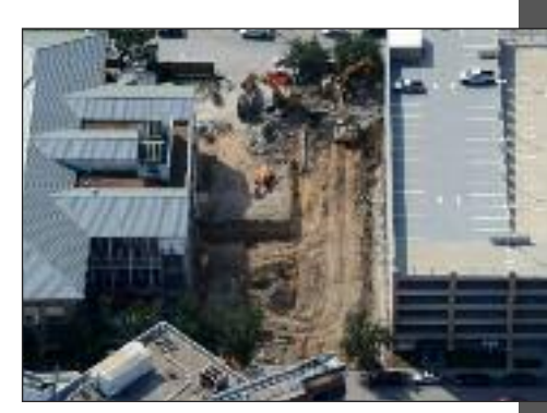
Aerial view of CAC Expansion

If you have not contributed to our Restoring Hope Rebuilding Lives Campaign, please do so today. You can donate by going to our website <a href="https://www.cachouston.org">www.cachouston.org</a>. We are very grateful for your support. No gift is too small. Every gift brings our goal closer to a reality. Will you help us make a difference in the lives of abused children? If not us, then who?