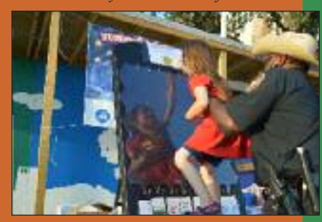
Harris County Sheriff's Office had safety resources and an interactive game for the kids.

October 6, 2015, The Children's Assessment Center hosted a National Night Out Event to support national efforts to build strong community partnerships that promote safe neighborhoods. The event was free and included fun activities for local families. Activities included demonstrations from emergency response vehicles such as Houston Police Department SWAT vehicle, a Harris County Sheriff's Office Tactical Vehicle, a Southside Place Fire Department Fire Truck and more. Other activities included face painting, a bounce house, music, food and a guest appearance by the Snow Queen. The CAC is so thankful to the community for making this a great family event.