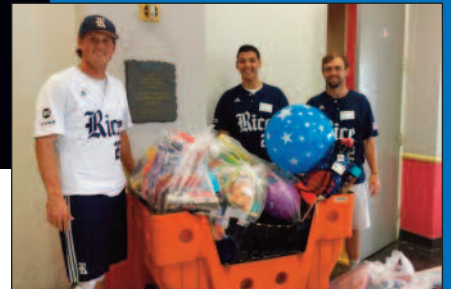
The Playroom would like to send out a big thank you to the Rice University Athletic Department for their financial donation as well as the toy drive conducted by The Rice Owls Baseball Team.