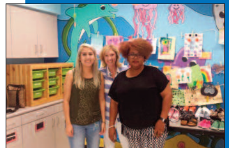
We would also like to thank Braeswood United States Postal Service for their continued support. Each year they host a Spring shoe drive for the kiddos. We received 118 pairs of shoes.