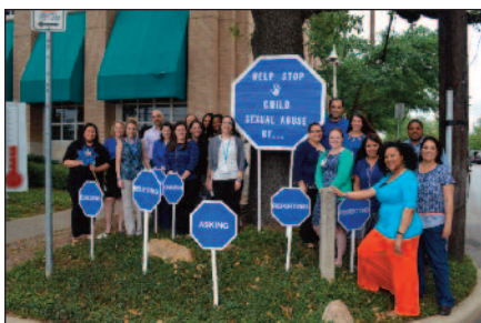
CAC Therapy and Psychological Services Department and their Stop Sign Project.

This year, The CAC's Therapy and Psychological Services Department created the "Stop Sign Project" to spread awareness throughout the month of April. The "Stop Sign Project" could be seen at the corner of Kelvin and Bolsover and included blue stop signs with messages on how to stop child sexual abuse. Along with signs, The CAC's T&P department took awareness messages to the streets every Wednesday and handed out handcrafted stop signs with a different statistic each week about child sexual abuse. The goal was to educate and empower the community to be a part of the solution to stop child sexual abuse. The CAC was very proud of T&P's project and looks forward to growing it in the community over the years.