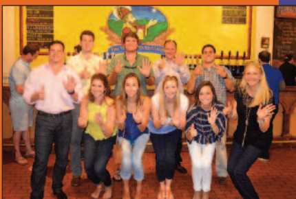
Stolte Family and Friends Giving Their 6!