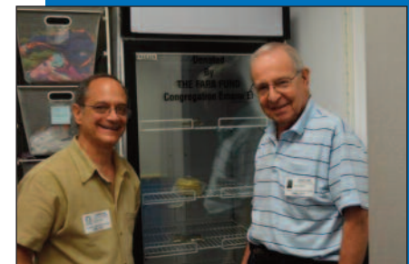
Last but not least we would also like to recognize Congregation Emanu El/Farb Fund for our brand new freezer.