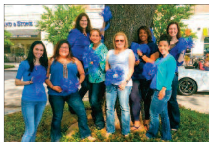
CAC staff displaying blue ribbons outside of The CAC and nearby Hanover Properties.