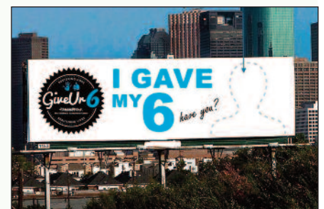
Copy to com

Our goal is to get one million people to donate $6! The money raised will help educate and heal children victims of sexual abuse and their families. To donate, go to www.GiveUr6.com .