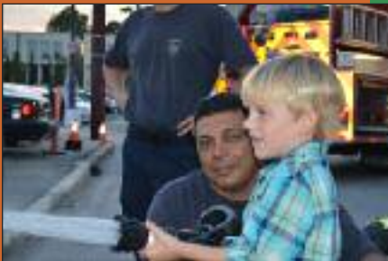
Southside Fire Department had hands-on demonstrations for children and families.