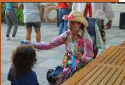
Houston Livestock Show & Rodeo Clowns are always a bit.