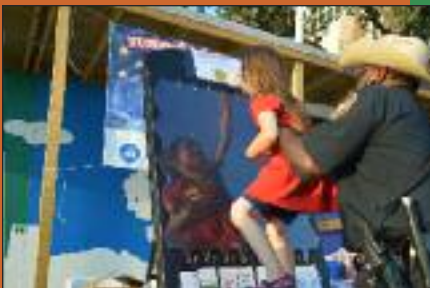
Harris County Sheriff's Office had safety resources and an interactive game for the kids.

October 6, 2015, The Children's Assessment Center hosted a National Night Out Event to support national efforts to build strong community partnerships that promote safe neighborhoods. The event was free and included fun activities for local families. Activities included demonstrations from emergency response vehicles such as Houston Police Department SWAT vehicle, a Harris County Sheriff's Office Tactical Vehicle, a Southside Place Fire Department Fire Truck and more. Other activities included face painting, a bounce house, music, food and a guest appearance by the Snow Queen. The CAC is so thankful to the community for making this a great family event.