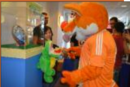
Houston Dynamo's Diesel gave a brushing demonstration