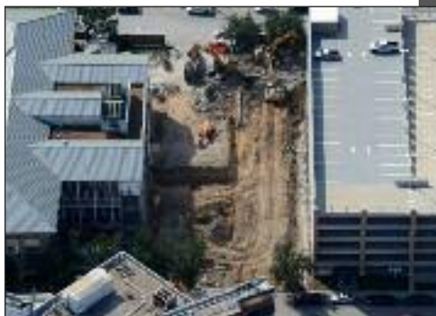
Aerial view of CAC Expansion

If you have not contributed to our Restoring Hope Rebuilding Lives Campaign, please do so today. You can donate by going to our website www.cachouston.org . We are very grateful for your support. No gift is too small. Every gift brings our goal closer to a reality. Will you help us make a difference in the lives of abused children? If not us, then who?