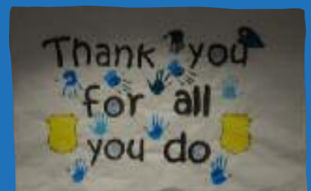
The CAC appreciates all the work our officers do.

September 14th-September 18th, 2015, The Children’s Assessment Center Foundation Board provided breakfast for CAC Law Enforcement office in recognition of Law Enforcement Appreciation Week. It was a fun week and gave CAC staff and partner agencies a chance to stop by and say thank you to the officers working hard each day to protect the children of Harris County. Thank you to everyone that participated. The CAC also like to sends special thank you to community members who donated and contributed giveaways to make the officers feel appreciated.