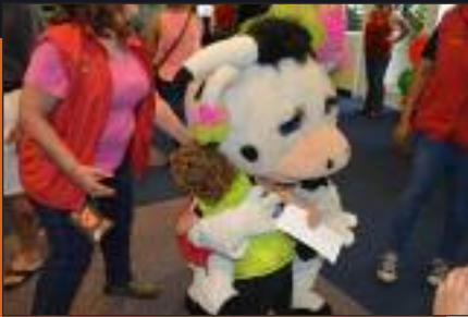
Children enjoyed hugs from the HLSR's Miss Moo.