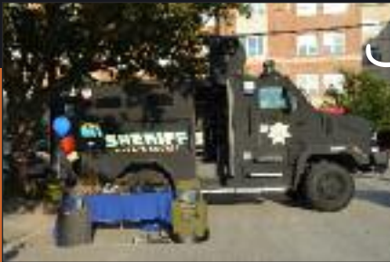
Harris County Sheriff's Office Tactical Vehicle