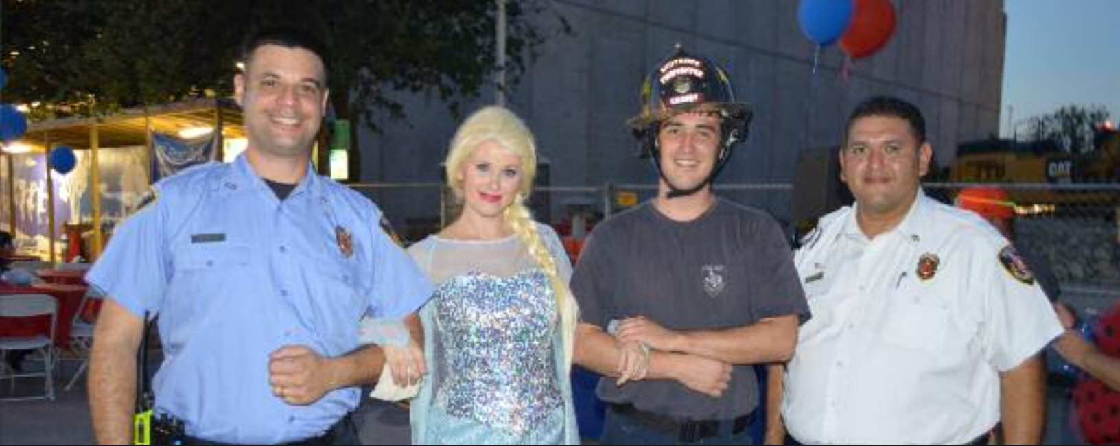
Southside Fire Department and Elsa the Snow Queen