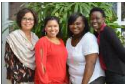
The new MEP Team!

The focus of MEP is to proactively strengthen and sustain The CAC’s Multidisciplinary Team (MDT) to ensure timely access to the full array of services for all children; and to ensure effective communication, coordination and collaboration at all stages of child abuse cases through our program at The Children’s Assessment Center.