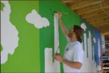
Thank you Chevron